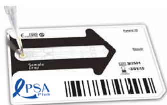
STEP 01. Load sample