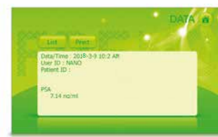
STEP 03. Get results