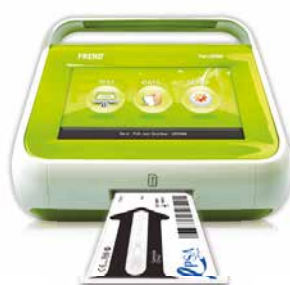
STEP 02. Insert cartridge